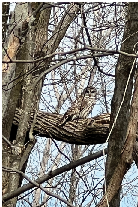
A large barred owl surveys his domain in the Cameron-Erlandsson section of Tabor Woods.

The ugly ground up by Hwy 31 was seeded in prairie last year—the whole front prairie got seeded two years ago. Not much is showing yet. The word is patience. During March most of that prairie area and the wetland was turned black by a burn in order to stimulate our flowers to appear.