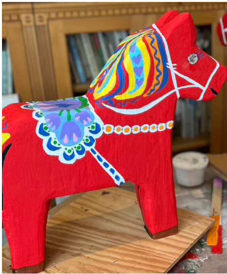
Riders should be on the lookout this year for any Dala ponies that have escaped into the route!