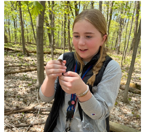
One of our 6th grade S2N students examining a small frog she found in Tabor Woods.

The S2N program is always looking for adults to volunteer and if you are interested and would like more information please contact Jill Baranowski at 262-930-2043 or jcbaranowski@sbcglobal.net .